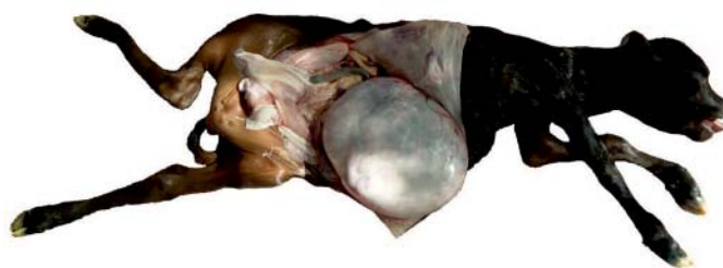
Fig. 1. Holstein-Friesian fetus showing a huge rounded mass in the abdominal cavity.

A seven-year-old Holstein-Friesian cow was brought to Hospital Campus, Veterinary College and Research Institute, Namakkal, India. The animal was pregnant for the third time and showing clinical signs of dystocia in the eighth month of gestation. The water bag ruptured a day before the animal brought to the hospital. Dystocia was relieved after careful obstetrical examination and a dead male fetus removed by forced traction. The fetus had a significantly distended abdomen.