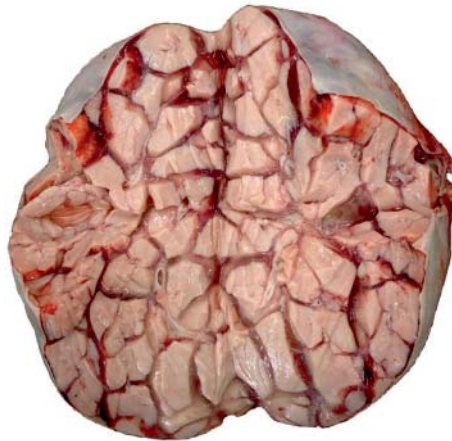
Fig. 2. Cut surfaces of the mass showing white cauliflower-like growth with red surfaces

At necropsy, the fetus showed a very large, round and well encapsulated extra renal mass (40 × 33 cm) in the abdominal cavity (Fig. 1). The abdominal cavity also contained about 5 litres of amber-coloured fluid. The weight of the mass was 3.8 kg and thickness of the capsule 1.3 cm. The capsule was grayish-white in colour. The cut surfaces of the mass resembled a white, cauliflower-like growth with red surfaces (Fig. 2). The lobules were spongy and distinctly demarcated by fat and hemorrhages. The kidneys and other visceral organs observed were normal. Representative pieces of the tissues from the mass were collected, fixed in 10% formalin solution, and routinely processed for histopathology.