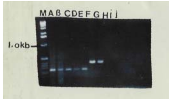
Fig. 1. Detection of the 387-bp specific-EHDV and the 251-bp specific BTV PCR products from infected BHK-21 cell cultures. Lane M: molecular weight marker; Lane A, B, C, D, and E: RNA from BHK-21 cell cultures infected with BTV serotypes 2, 10, 11, 13 and 17; respectively. Lane F and G: RNA extracted from BHK-21 cell cultures infected with EHDV serotypes 1 and 2, respectively; Lane H, I and J: Total nucleic acids extracted from non infected BHK cell cultures (negative controls).