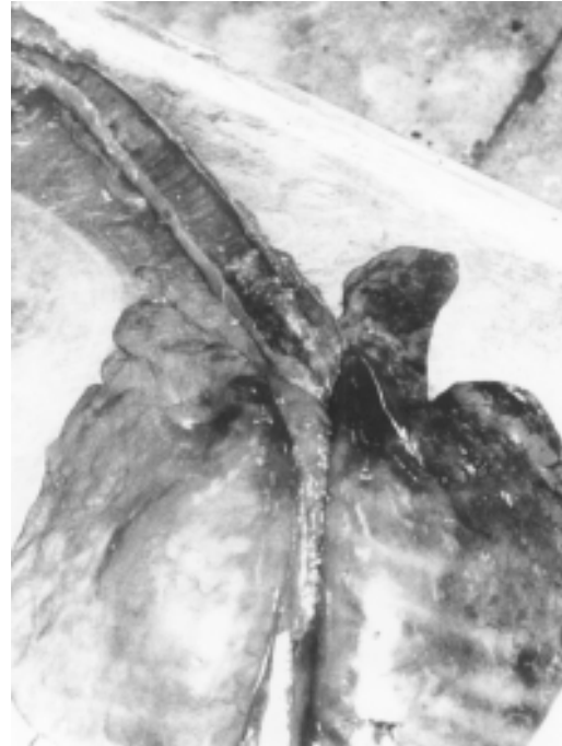
Fig. 1. Aspergillus pneumonia in the lung of a horse. The presence of a large amount of fibrinopurulent exudate in the bifurcation and consolidation of anteroventral lobes

after primary admission. The animal underwent necrotomy and all organs were carefully and systematically examined. Suspect tissues were fixed in 10% buffered formalin, cut at 5 \mu m, and stained with hematoxylin and eosin (HE). Selected tissues were stained using Periodic Acid-Schiff (PAS) technique. Bacteriologic specimens were cultured on Blood agar, Sabouraud's agar and differential media (TIMONEY et al., 1998). Post-mortem examination of the respiratory system revealed congestion, edema and petechial haemorrhages of trachea and the presence of a large amount of yellowish fibrinopurulent exudate in the tracheobronchial airways, particularly in the bifurcation, and also reddish-grey consolidation of anteroventral lobes of lung (Fig. 1). Histopathological study of lung sections showed fibrinopurulent pneumonia, severe necrotizing bronchitis and bronchiolitis with purulent and mononuclear inflammatory response, and existence of large colonies of irregularly dispersed hyphae in the lumen of