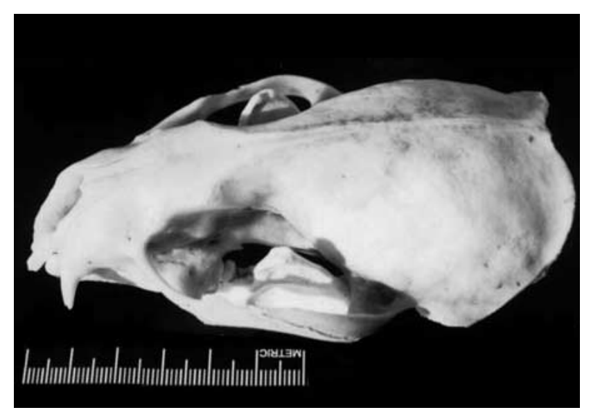
Fig. 1. General view of otter's skull

palatine bone was wide, while the perpendicular lamina of the palatine bone was narrow. The dental formula of upper jaw was I3, C1, P3, M2. The body of the mandible (corpus mandibulae) was narrow and long. Five mental foramina (foramina mentalia lateralia) were detected. The massateric fossa (fossa masseterica) was deep, the coronoid process (processus coronoideus) was wide, and the condylar process (processus condylaris) was convex. Angular process (processus angularis) was observed. The dental formula of the lower jaw was I3, C1, P3, M2.