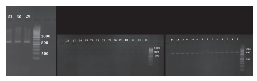
Fig. 1. Agar gels electrophoresis of PCR

On the right side are the numbers of bp, and above the numbers of FAdV positive samples, from lines 1 - 31 (The length of bands is 870 bp of the hexon gene)