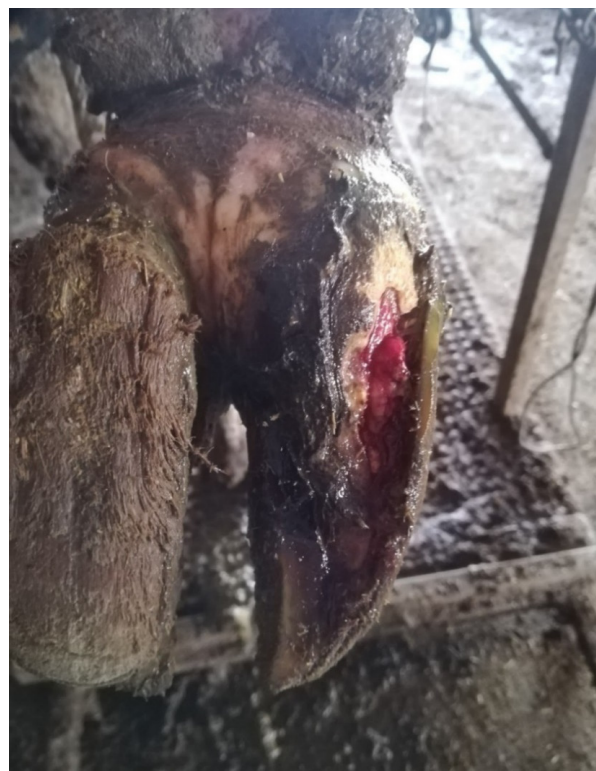
Fig. 2. Severe sole ulceration, hemorrhage and interdigital flegmon.