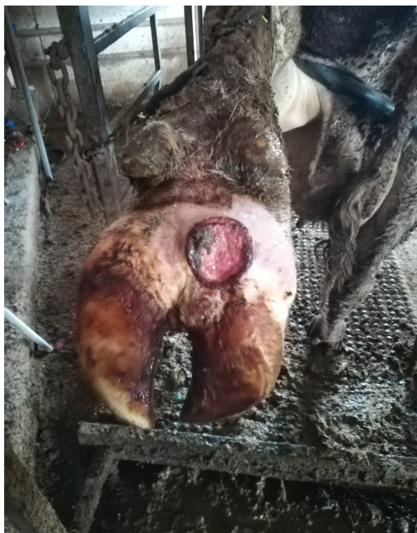
Fig. 1. Severe digital and interdigital dermatitis.