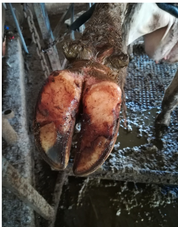
Fig. 3. Foot rot disease.

Biochemical Results. In the Foot Disease Group, native thiol ( P<0.01 ), total thiol ( P<0.05 ), disulfide ( P<0.01 ), disulfide/native thiol (%) ( P<0.01 ), and disulfide/total thiol (%) ( P<0.01 ) results were found to be significantly higher than in the Control Group. In the Control Group, native thiol/total thiol (%) ( P<0.01 ) was found to be significantly higher than in the Foot Disease Group. The analysis of the results of both groups are shown as values in Table 2 and as box plot charts in Fig. 4.