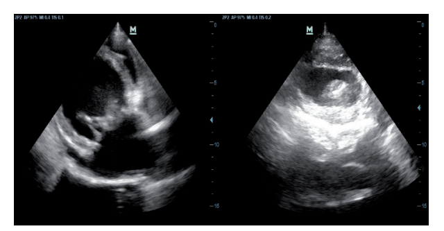
Fig. 1. The characteristic echocardiographic lesion from dogs in the infective group

The characteristic echocardiographic lesion on the mitral valves was regarded as the major duke criteria in the infective group (Fig. 1). Also, dogs in this group were positive for systemic inflammatory response syndrome (SIRS), as reported by HAUPTMAN et al., (1997) and SILVERSTEIN (2015) on the basis of their body temperature (mean 40.00 \pm 0.40 °C), heart rate (mean 147.33 \pm 17.08/ min), respiratory rate (mean 37.83 \pm 9.15/ min) and WBC counts (mean 33.97 \pm 9.10 \times 10^3/\mu L).