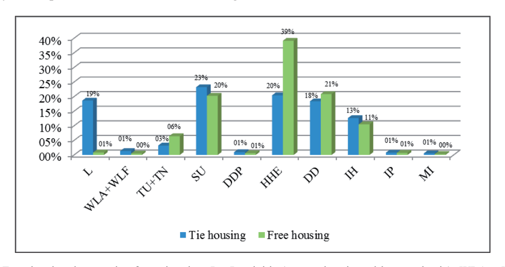
Where: FT - Functional and corrective foot trimming; L - Laminitis (acute, chronic and haemorrhagic); WLA + WLF - White Line Disease; TU+TN -Toe Ulcer and Necrosis; SU - Rusterholz Ulcer / Sole Ulcer (septic and aseptic; DDP - Digital Dermatitis Papillomatous; HHE - Dermatitis Interdigitalis - Heel Erosion; DD - Digital Dermatitis (all M - stages); IH - Fibrom-Interdigital Hyperplasia / Tyloma; IP - Panaritium / Interdigital Phlegmon / Foot Rot; MI - Mechanical Injury.

system (P<0.01), and Toe Ulcer and Necrosis was also more common in the free system but with no statistically significant difference (P>0.05), (Table 2). As previously mentioned, Figure 2 shows that these diseases/disorders in hoofs lead to too early culling of animals from further production, despite the two different systems.