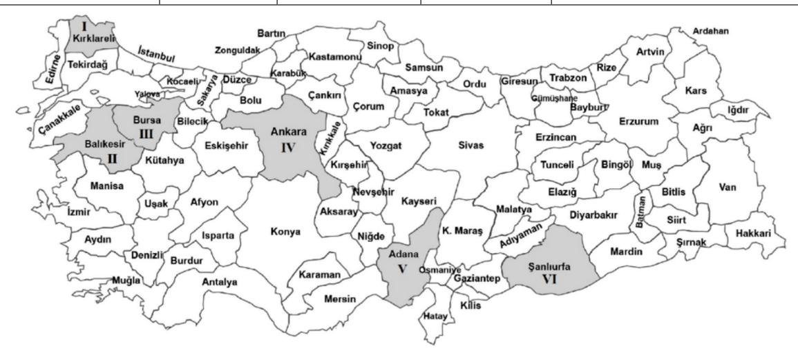
Fig. 1. The map showing the cities (with gray colors) where the farms (I to VI) sampled in this study