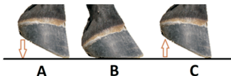
Fig. 2. Parts of the stance phase; A - Contact phase, B - Foot flat, C - Propulsive phase