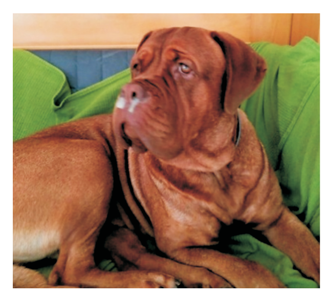
Fig.1. Symptoms of allergy in the dog - the presence of nasal discharge