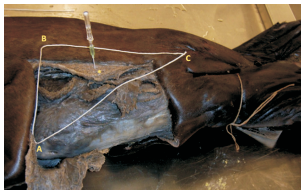
Fig. 2. Anatomical landmarks for sciatic nerve access in California sea lions. The position of the needle (*) in the center of a triangle between the femorotibial joint (A), the dorsal midline (B) perpendicular to the femorotibial joint and the base of the tail (C).

tracing the lines between the femorotibial joint, the point on the dorsal midline, perpendicular to the femorotibial joint, and the base of the tail. The position of the needle should be in the same transversal plane, at half of the imaginary triangle's hypotenuse length (Fig. 2). The slightly caudoventral needle inclination needed for the needle position in California sea lions brings the needle to the immediate vicinity of the cranial and caudal branches of the sciatic nerve (Fig. 3).