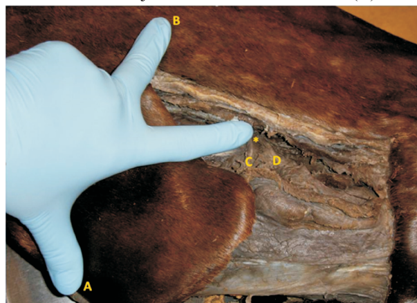
Fig. 3. Approximate distance of anatomical landmarks for sciatic nerve access in California sea lions. The position of the needle (*) in the center of a triangle between the femorotibial joint (A), the dorsal midline (B) perpendicular to the femorotibial joint and the base of the tail (not shown in this figure; shown on Fig. 2) is finger reachable. The injection site described (*) brings the needle into the immediate vicinity of the cranial branch (C) and the caudal branch (D) of the sciatic nerve.