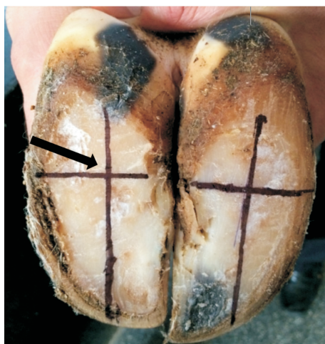
Fig. 1. Point (arrow) where the probe was placed while measuring sole thickness