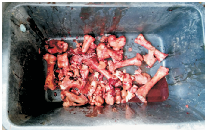
Fig. 2. Remnants of the macerated foetus, which were removed from the uterus. The head and forelimbs were missing, because they had been removed by a local veterinarian on the farm 14 months before.