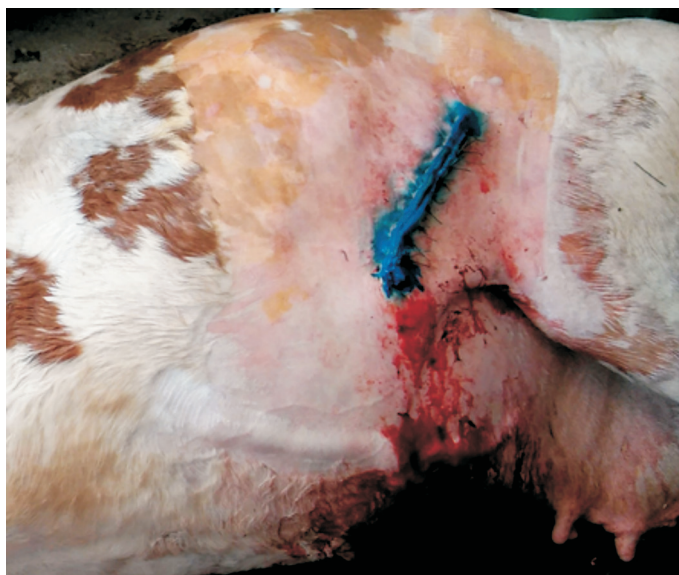
Fig. 3. Localization of the low-flank surgical approach

we chose an incision in the middle of the abdominal wall with the so-called low-flank approach (Fig. 3). The incision was performed obliquely in a caudo-ventrocranial direction. This incision location leads to easier access and exteriorization of the uterus (WERMUNT, 2008), thus minimising the risk of peritonitis, and it also provides better conditions for wound healing and removal of stitches post operatively. A hysterotomy of the uterus with a macerated foetus usually has a poor prognosis. BOUCHARD et al. (1994) published that only six out of sixteen cows with emphysematous foetus survived a caesarean section.