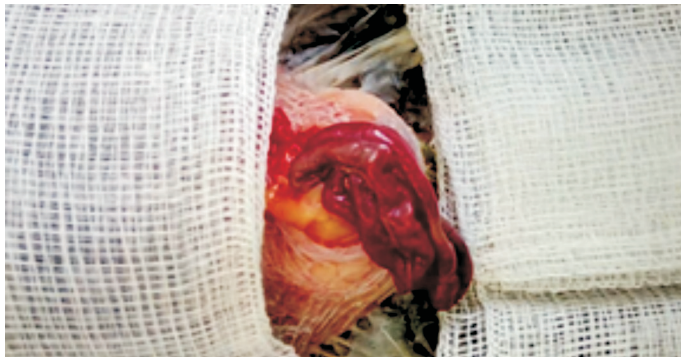
Fig. 3. The yellowish fat tissue mass with intestine adhesion in the hernia sac

The animal was clinically stable and herniorrhaphy under general anesthesia was suggested. Pre-surgical starvation was initiated only for the last one hour. The cockatiel was placed under general anesthesia using ketamine hydrochloride in a dosage of 30 mg/kg and butorphanol in a dosage of 1 mg/kg, applied to the pectoral muscle. General anesthesia was maintained with 2.5% sevoflurane and oxygen 2L through a breathing mask. After feather removal and surgical field preparation, the cockatiel was placed in semi dorsal recumbency on a soft veterinary diaper with a heating pad underneath, with its head slightly raised to prevent aspiration. The wings were placed close to the body, while the legs were restrained by the assistant's hands and abducted in the caudal direction. A herniotomy was performed using blade No. 15 and micro scissors. It revealed a yellowish fat mass with intestine adhesion, and a small opening on the abdominal wall cranial to the cloaca (Fig. 3). The hernial contents were inspected and reduced using