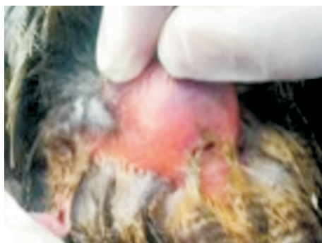
Fig. 1. The mass 3 cm in diameter ventral to the cloaca with featherless area

A five-year-old cockatiel, weighing 108 grams, was referred to the Surgery Clinic of the Faculty of Veterinary Medicine in Zagreb, Croatia, with a 2 month history of abdominal swelling and occasionally obstipation. The swelling became larger and larger over one month to almost 3 cm in diameter (Fig. 1). The owner presented radiographs with contrast showing a suspected ventral abdominal hernia, as shown in Fig. 2. On admission the cockatiel had a rectal temperature of 40 °C with a pulse of more than 200 beats per minute. Its respiratory rate was 30 breaths per minute. The floor of the bird cage was full of normal colored excrement. On the ventral side of the abdomen, 1 cm from the cloaca, a painless, non-reducible yellowish mass, 3 cm in diameter, was noticed. The skin above was without feathers.