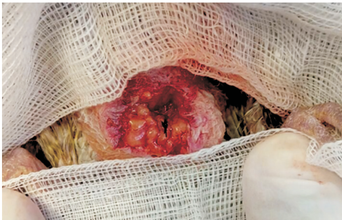
Fig. 5. Abdominal wall defect closure with polyglyconate 4-0 sutures

Postoperative management consisted of analgesia with meloxicam 0.5 mg/kg subcutaneously for 3 days. A heating pad was used until the cockatiel was on its feet. Cage