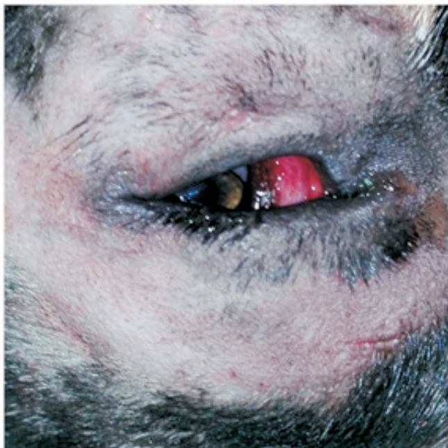
Fig. 3. Postoperative appearance of the affected eye shows normal third eyelid position following correction of the everted cartilage and repositioning of the prolapsed gland.

The prolapsed nictitans gland was also considered to be secondary to the everted lid. Treatment was initiated with 0.3% ciprofloxacin eye drops q8h and 0.5% diclofenac eye drops q6h as antibacterial and non-steroidal anti-inflammatory analgesic drugs, respectively, but this topical therapy was unsuccessful after one week. So, surgery was considered. The animal was premedicated with 0.05 mg/kg acepromazine intramuscularly. Anesthesia was induced intravenously with 10 mg/kg thiopental sodium and maintained with isoflurane. The dog was positioned in lateral recumbency, and the affected eye was surgically prepared by the standard method (MAGGS et al., 2012). The nictitans membrane was anchored with forceps and extended anteriorly. On the bulbar surface, the conjunctiva was gently dissected from the underlying cartilage by a blunt cut. The scrolled cartilage was incised with a scalpel, just below the junction of the vertical with the horizontal portion of the T, but no sutures were placed. After that, the nictitans gland was replaced by the Morgan pocket technique, with two inverting sutures using absorbable material (6/0 Vicryl). Electrocautery was used to control the bleeding. The dog recovered uneventfully, and an Elizabethan collar was applied postoperatively to prevent self-trauma. Additionally, the patient was treated by tramadol as a strong pain