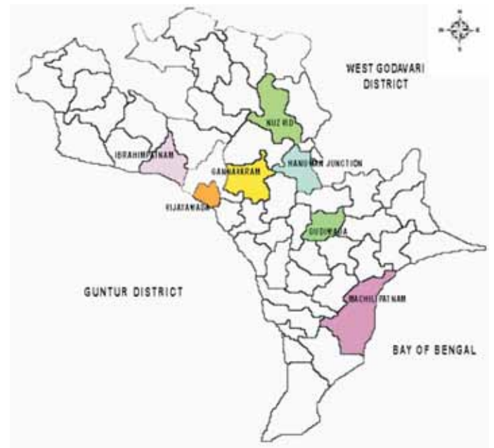
Fig. 1. Location map of sampling areas

Collection of parasites (Haemonchus contortus) : Adult male Haemonchus contortus worms were collected directly from the abomasum of various sheep brought to the local abattoirs in Krishna district, Andhra Pradesh. In order to have a representative sample of H. contortus worms from all the Animal Husbandry divisions of the district, a Random Stratified sampling method was used to select the areas, and the worms were collected from the Vijayawada (31), Gannavaram (60), Hanuman Junction (31), Ibrahimpatnam (32), Nuziveedu (23), Gudiwada (22) and Machilipatnam (27) regions (Fig. 1). A total of 226 parasites were collected and preserved in 70% alcohol at -20 °C until use, after washing in PBS (pH 7.4).