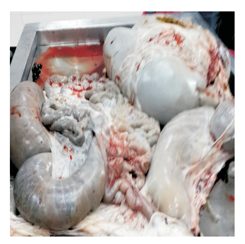
Fig. 8. The forestomach and caecal constipation

According to the haematological examination results, the total leukocyte count, erythrocyte count, haematocrit value and haemoglobin level were 14\times10^3/\mu\text{L} (reference range 4\text{-}12\times10^3/\mu\text{L} ), 8.5\times10^6/\mu\text{L} (reference range 8\text{-}15\times10^6/\mu\text{L} ), 27% (reference range 24-49%) and 9.5 g/dL (reference range 8-16 g/dL), respectively. Serum biochemical tests demonstrated that the levels of the enzymes aspartate aminotransferase (379 IU/L, reference range 49-123.3 IU/L), gamma-glutamyl transferase (57 IU/L, reference range 19.6-44.1 IU/L), creatine kinase (337 IU/L, reference range 7.7-101 IU/L) and lactate dehydrogenase (646 IU/L, reference range 83.1-475.6 IU/L) exceeded the upper reference