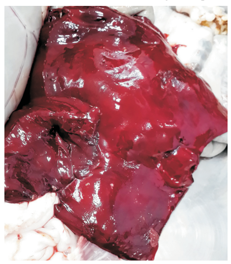
Fig. 4. Coagulated blood in the abdominal cavity