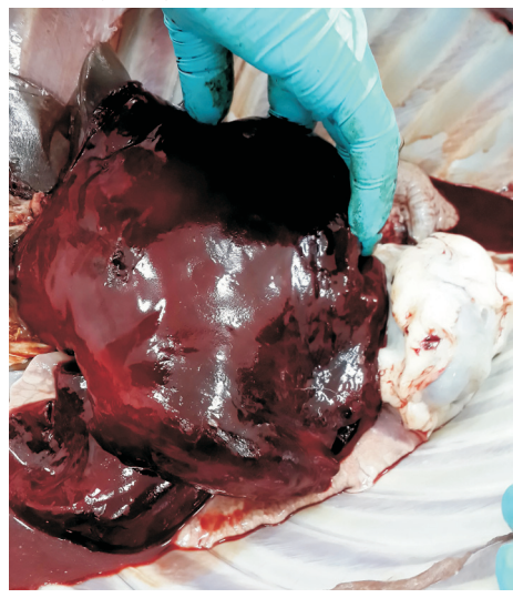
Fig. 5. Coagulated blood in the thorax