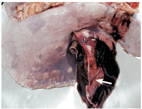
Fig. 6. Rupture of the right cranial lobe of the lung (arrow)