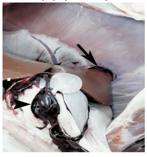
Fig. 1. The herniation of the liver into the thoracic cavity through an opening in the diaphragm (arrow) and coagulated blood (arrowhead)

A two-year-old sheep was referred to the clinics of the Department of Internal Medicine of Dicle University, Faculty of Veterinary Medicine, with signs of anorexia, abdominal tympany and constipation.