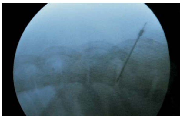
Fig. 2. C-arm image of implanted photofiber in the Th13-L1 herniated disc

In the treated dog, neurological symptoms were eliminated as the result of PLDD. Pain and ataxia subsided on the second day after surgery. Voluntary motor function and normal pain responses returned within two weeks. The results of clinical and neurological tests were consistent with SSEP readings. Before surgical treatment, recorded waveforms were reduced. When the SSEP waveforms were registered two days after treatment, their latencies were shorter and amplitudes increased. Moreover, the SSEP test repeated two days after surgery demonstrated the functional integrity of afferent pathways of the spinal cord, thus verifying the effectiveness of the applied surgical technique (Fig. 3).