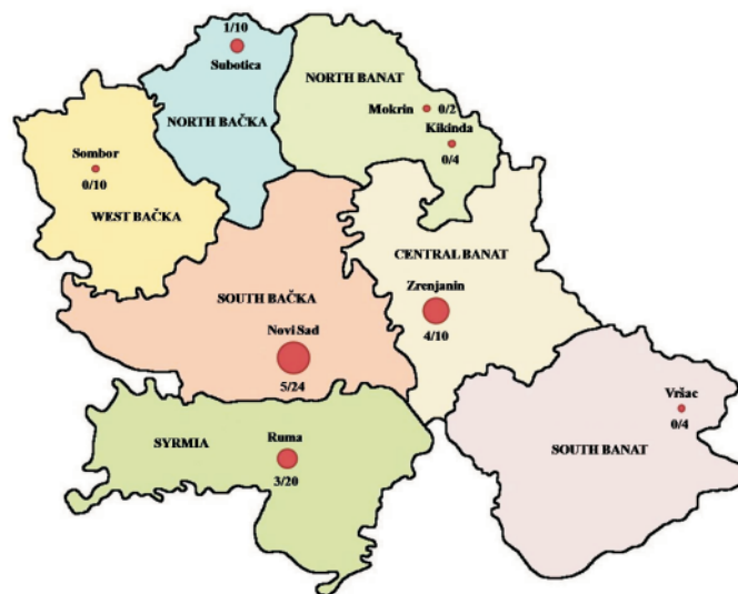
Fig. 2. Distribution of the positive and total samples by districts of the Autonomous Province of Vojvodina