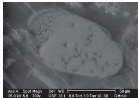
Fig. 5. Electron micrograph of dog limbal cell, 5 days after ingrowing, visualized using electronic microscope XL30 ESEM, Philips, Netherlands (Centre for Forensic Investigations, Research and Expertise „Ivan Vučetić“, Zagreb, Croatia) in which specific membrane receptors are tied fluorescein dye conjugated mouse monoclonal antibody against p63 dog cornea.