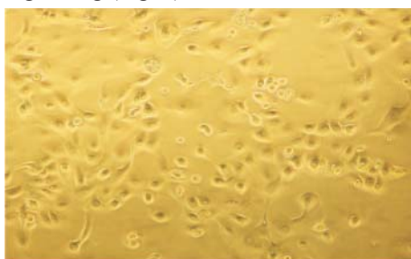
Fig. 2. In explant culture of dog limbal cells, 5 days after ingrowing, \times 40

Dog limbal cells within “ in explant ” cultures, achieved 80 % confluence 5 days after ingrowing (Fig. 2). Using an electronic microscope, it could be seen that cells within the secondary cultures were of equal size, approximately 14.5 \mu\text{m} \times 13.4 \mu\text{m} , five days after ingrowing (Fig. 3).