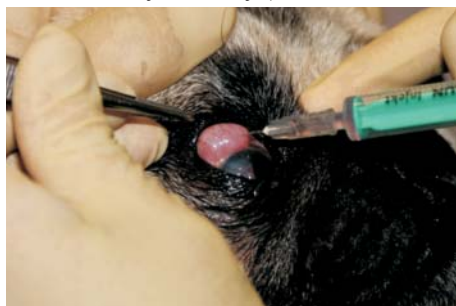
Fig. 1. Subconjunctival application of limbal stem cell in dog

Application of the limbal stem cell suspension: 1 \times 10^6 cells in 1 mL SFM medium, prepared in the syringe, were applied to the dogs under local anaesthesia (1 % tetracaine hydrochloride eye drops, three times within 5 minutes in the affected eye subconjunctivally) (Fig. 1). The dogs were treated 3 days before and 7 days after this procedure with local antibiotics (tobramycin drops, Alcon) and 2 days before and 5 days after the application of the cellular allograft with local corticosteroid preparations (dexametason drops three times daily in the eye).