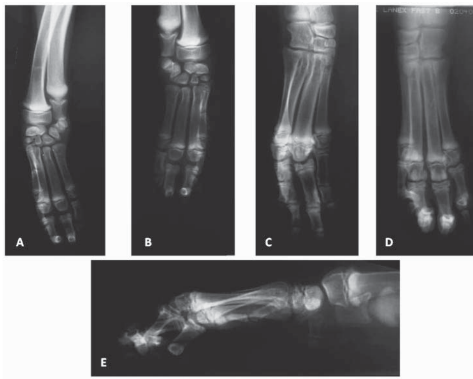
Fig. 3. Radiographic view of all limbs of the affected puppy. A) Palmodorsal view of the right thoracic limb and B) left thoracic limb. C) Plantodorsal view of the right pelvic limb, and D) left pelvic limb. Note that none of the four limbs presents fused digits E) Mediolateral view of the affected puppy in a weight bearing position at presentation. Hyperflexion proximal and distal interphalangeal joints of all digits.

Meloxicam (Mobicox®), at 0.2 mg/kg per oral (PO) initially, was administered followed by 0.1 mg/kg PO q 24 h. To alleviate the severe lameness, surgery on all digits of the left thoracic limb was performed. The patient was premedicated with acepromazine (Promace®, Pfizer; 0.01 mg/kg IM) and tramadol (Tradol®, Grünenthal; 1 mg/kg IM). Subsequent to induction with propofol (Diprivan®, AztraZeneca; 6 mg/kg IV), the animal was intubated and anaesthesia was maintained on 1.5-2% isoflurane (Forane®, Abbott) and oxygen. A palmar approach between the proximal and middle phalanges was made. The deep digital flexor tendon of digits 2-5 was identified and transected. Fibrosis was found associated with each phalanx, which was resected with a Metzenbaum scissor.