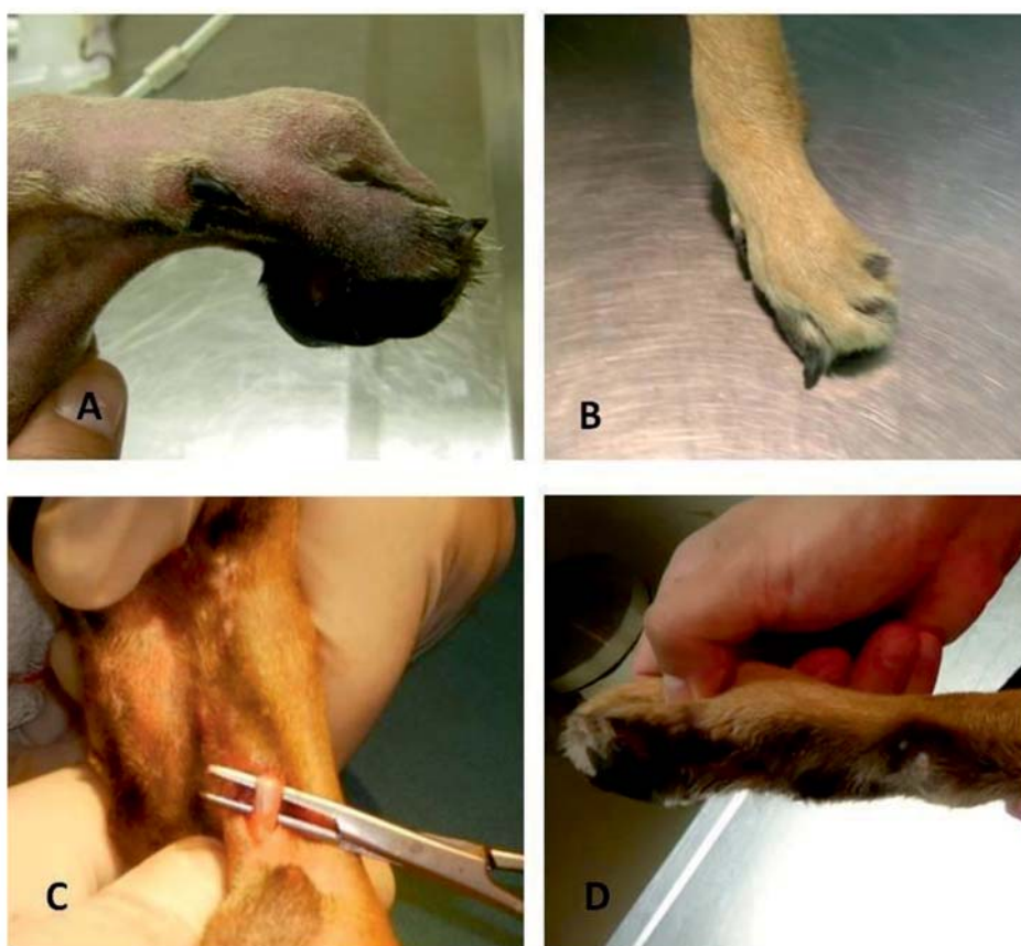
Fig. 4. Photograph of left thoracic paw at presentation. A) mediolateral view before the first surgery. Note the hyperflexion of digits instead of paw and the excessive tension of the tendon. B) craniocaudal view after first surgery. Note the lateral deviation of the fifth digit. C) View of the second tenotomy, the procedure was performed right at the insertion of the tendon over the metacarpus. D) Lateromedial view after the second surgery, note the normal position of the paw, without hyperflexion or hyperextension.

Recovery from anesthesia occurred without incident. Tramadol (1 mg/kg IM once) was administered for post-surgical pain management, and a modified Robert-Jones bandage was placed to prevent post-operative swelling. Meloxicam (0.1 mg/kg PO q 24 h) was continued for seven days.