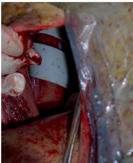
Fig. 1. View of the progesterone-releasing intravaginal device on the uterus during surgery