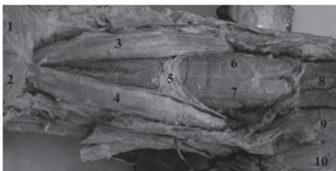
Fig. 3. Ventral view of the dog No. 3 neck: 1. right pectoralis descendens muscle (m. pectoralis descendens dexter), 2. left pectoralis descendens muscle (m. pectoralis descendens sinister), 3. right sternocephalicus muscle (m. sternocephalicus dexter), 4. left sternocephalicus muscle (m. sternocephalicus sinister), 5. additional muscle bundle and fibres, 6. right sternohyoideus muscle (m. sternohyoideus dexter), 7. left sternohyoideus muscle (m. sternohyoideus sinister), 8. mylohyoideus muscle (m. mylohyoideus), 9. digastricus muscle (m. digastricus), 10. masseter muscle (m. masseter).

the course of the main muscle belly, and terminated cranially on the ventral border of the same muscle. From this additional muscle bundle, at the level of the middle of the neck, a few transverse additional fibres separated and connected to transverse fibres diverging from the ventral border of the right sternocephalicus muscle. Fat and connective tissue filled the space between these thin transverse additional fibres.