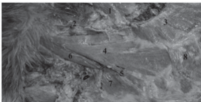
Fig. 4. Lateral view of the dog No. 4 neck: 1. serratus dorsalis cranialis muscle (m. serratus dorsalis cranialis), 2. serratus ventralis cervicis muscle (m. serratus ventralis cervicis), 3. serratus ventralis thoracis muscle (m. serratus ventralis thoracis), 4. scalenus dorsalis muscle (m. scalenus dorsalis), 5. additional muscle bundle, 6. scalenus medius muscle (m. scalenus medius), 7. rectus thoracis muscle (m. rectus thoracis), 8. obliquus externus abdominis muscle (m. obliquus externus abdominis).