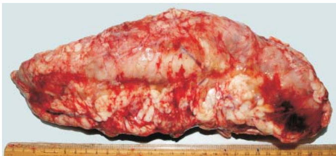
Fig. 1. The extremely enlarged mediastinal lymph node of a cow infected with M. caprae

At necropsy of eleven animals, lesions consistent with tuberculosis were observed on the lymph nodes and lungs in all carcasses. The most striking pathomorphologic findings were very enlarged mediastinal (Fig. 1.) and bronchial lymph nodes. Lymph nodes were firm with a smooth surface and a few nodular elevations up to 1 cm in diameter. On cutting, the nodes were gritty due to mineralization, with diffuse loss and replacement of parenchyma with gray to yellow caseous material, intersected with thick bundles of grey to white fibrous connective tissue. In the lung parenchyma there were multiple caseous nodules ranging from small solitary to botryoid forms, which contained creamy to caseous, white to yellow material. In one animal about 50% of the lung parenchyma had been replaced by multiple, various size echinococcal cysts. In another, there were multifocal various sized (up to 20 cm) abscesses, filled with thick, creamy, yellow to grey odorous material (pus) in the pericardium and extending on to the left muscular part of the diaphragm. No tuberculous lesions were observed on other organs.