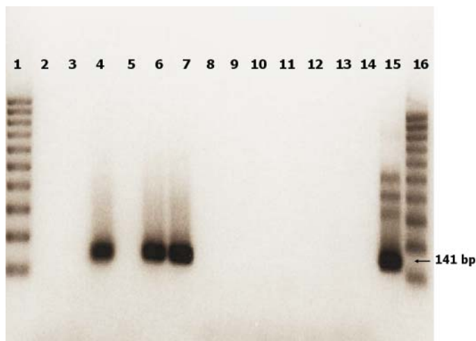
Fig. 3. Detection of the spring vireamia of carp virus (SVCV) in cyprinids by reverse transcription PCR (RT-PCR). Lane 1 and 16: 100 bp ladders (Abgene); lane 2 and 3 negative PCR control; lane 4, SVCV positive in silver crucian carp; lane 6 and 7 SVCV positive in common carp; lane 5, 7-14 negative SVCV; lane 15 SVCV positive control at 141 bp.