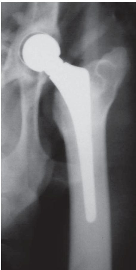
Fig. 2. Radiography of endoprosthesis: VD projection, 6 months after operation