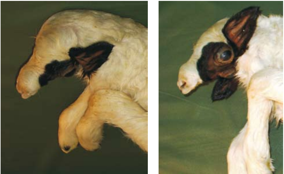
Fig. 1. Dorsolateral (left) and ventrolateral (right) aspect of the head of the agnathic lamb

with increased in size (macrophthalmia), protruding eyeballs (exophthalmia) could be observed. The occipital condyles were present but it was impossible to distinguish and identify the bones of the skull. No apparent foramens except the foramen magnum could be observed. The hyoid apparatus was absent. On the lateral parts of the skull a branching vessel resembled the facial artery. The salivary glands were absent. The cranial cavity was almost empty, except a small amorphous encephalic substance which appeared to be undifferentiated. Dissection of the body revealed the absence of the right kidney and ureter.