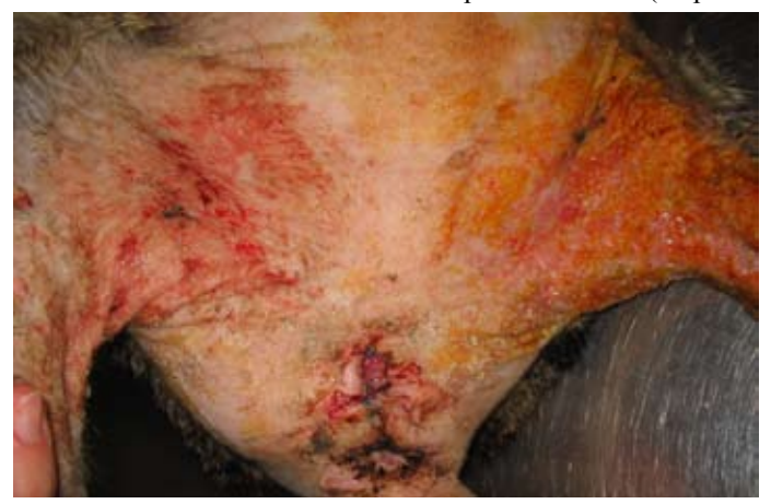
Fig. 1. Abdominal and inner thighs affected skin

exocytosis. Dermis oedema presented with neutrophils diapedesis in vessels (Fig. 2). Also ulceration with fibrin exsudation and degenerated neutrophils embedded inside were seen. The dermis was reactive with numerous neutrophils in vessels (diapedesis).