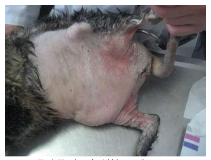
Fig. 3. Five days after initial proceeding

become less dramatic, the lesions involved were less reddish and became dry. On the third day, the cat was better and started eating without manual feeding. On the fourth day the skin lesions were dry. Local therapy (povidone iodine) was maintained and the cat was sent home on day 5 (Fig. 3). Treatment was continued at home by the cat's owner. Control exam was on 10<sup>th</sup> day.