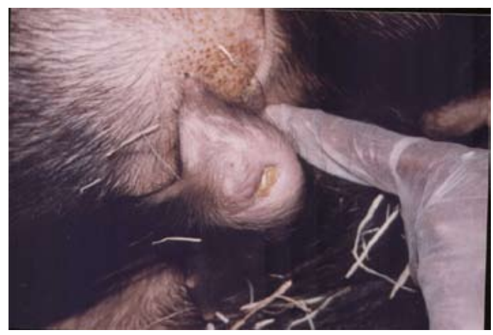
Fig. 3. Recovery of the experimentally infected sheep, however, note sign mark of udder fistula

Antibody response. Examination of serum for the presence of antibodies showed that all the infected sheep and goats sero-converted to orf virus. All the five infected sheep showed a similar pattern of serological response (Fig. 4). A gradual increase in the neutralising antibody titre was noted to start from day 7 post-infection.