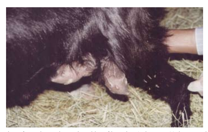
Fig. 2. Early sign of eruptive scabs on the udder of lactating Ardy goats 11 days post-infection