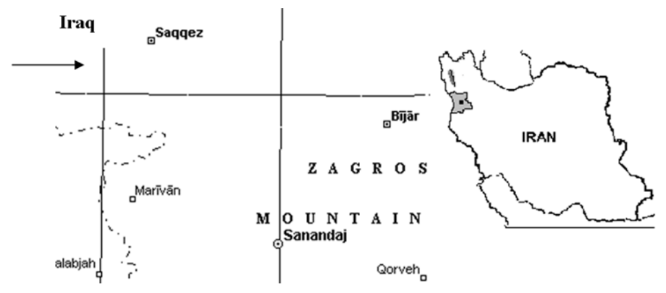
Fig. 1. The map of Sanandaj area and locality where the field study was conducted