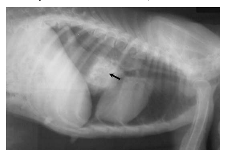
Fig. 2. Left lateral thoracic view of a dog with hypertrophic osteopathy. An oval, radio dense mass located in the caudal thoracic oesophagus, immediately caudal to the heart (arrow).

Clinical findings . Clinical examination revealed pyrexia (40.1 °C), tachycardia (132 beats per minute) and tachypnoea (40 breaths per minute), poor body condition, bilateral mucopurulent ocular discharges and hard, painless swelling of all four limbs. Haematological parameters showed a decreased in Packed Cell Volume of 32% (normal is 37-55%) and neutrophilia at 87% (60-77% is normal).