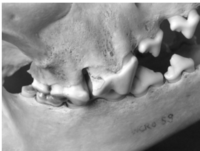
Fig. 3. Periodontitis with signs of alveolar bone loss in alveoli of fourth maxillary premolar with a complicated crown-root fracture and deposit of calculus on the same tooth, buccal view, in wolf N° WCRO 59, 5.4-year-old female