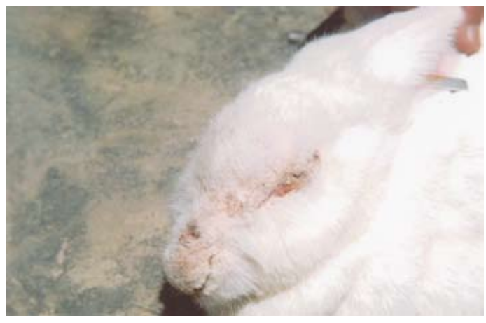
Fig. 1. New Zealand white rabbit affected with concurrent acariosis of face involving upper lip to eyelids, which are closed. The area shows scaly skin and alopecia.

extending to the full face and lower jaw, and involved ear pinnae, and lips and both eyelids, which were then closed and contained thick whitish exudates (Fig. 1). The affected regions showed scales, lichenification, alopecia and scab formation. The rabbits showed pruritis and were intermittently scratching the area with front paws. Later, hemorrhagic crusts with fissures developed, even becoming eroded in places. The condition of the affected rabbits was weak and body coat was ruffled.