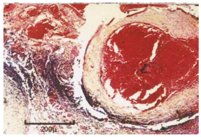
Fig. 7. Section of skin revealing engorgement of sinus hair follicles with blood and haemorrhages in the dermis. Weigert's H&E; scale bar = 200 \mu m .

Histopathology and histochemistry. Lesions were characterized by hyperkeratosis with both ortho- and parakeratosis, acanthosis with formation of rete ridges projecting downward into the underlying dermis (Fig. 4). Cross- sections of the mites were seen in niche-like burrows in the epidermis, and the adjacent epidermis had grown in the form of rete papillae on the sides of the mites (Fig. 5). A few mites were in malphigian layer and had even penetrated the dermis, localizing in hair follicles. Some acanthotic tissue revealed hydropic degeneration. Formation of keratin cysts was noted in the epidermis. Subepidermal dermatitis was characterized by infiltration of mononuclear cells of macrophages and lymphocytes, as well as heterophils (Fig. 6). The sinus hair follicles were engorged with blood. Exfoliation of epidermis, with congestion and haemorrhages, was noted in dermis (Fig. 7). The sections were negative for metachromasia, and the epidermis and hair follicles revealed an increase in acid mucopolysaccharides.