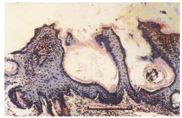
Fig. 5. Section of skin showing presence of mites (arrow) in burrows in the epidermis; the epithelium reveals rete papillae formation. Weigert's H&E; scale bar = 200 \mu m .

Necropsy. Cut surface of the skin revealed thickness of its layers and dilatation of the hair follicles with dark centres giving appearance of tunnels (Fig. 3). Haemorrhages were evident in those having crusts.