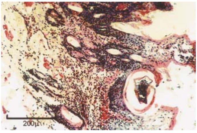
Fig. 6. Section of skin showing sub-epidermal dermatitis with infiltration of mononuclear cells and heterophils. Weigert's H&E; scale bar = 200 \mu m .