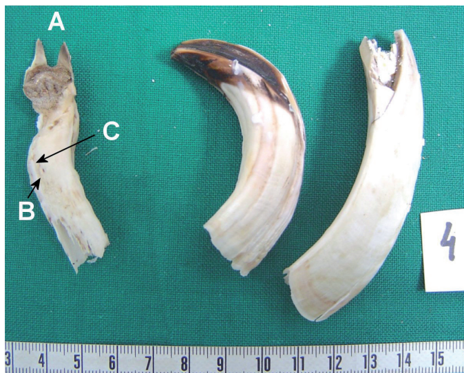
Fig. 1. Tusk set of wild boar No. 4. Note severely malformed right C inf. (A) with irregular surface (C). Dilacerated region was filled with wax during the standard preparation procedure.