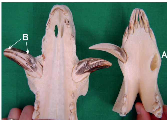
Fig. 6. Tusk set of wild boar No. 19. the right C inf. is missing. Note abnormal position of its alveolar opening (A), which is misplaced posteriorly. Right P3 and P4 are rotated. Position and length of the wear surface of the right C sup. (B) indicate later onset of attrition.