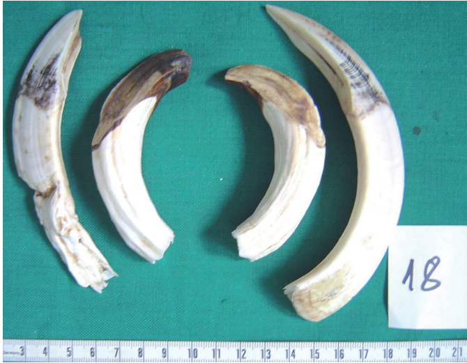
Fig. 3. Tusk set of wild boar No. 18. Note notch on the right C inf. and severely altered proximal portion of this tooth.