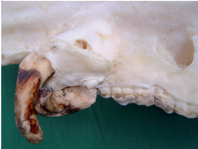
Fig. 4. Duplication of the left C sup. In wild boar No. 7. Note downward projection of the anterior of the two canines and horizontal position of the posterior tusk, which has grown against the anterior one.