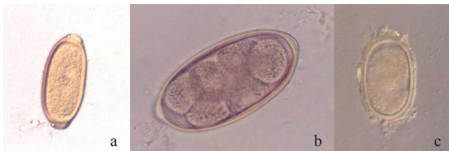
Fig. 1. Endoparasites in pheasant ( Phasianus colchicus ) – flotation method. a) Capillaria spp.; b) Syngamus trachea ; c) Heterakis isolonchae