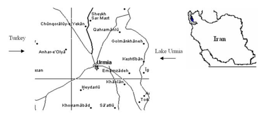
Fig.1. Map of sampling areas and farm positive to investigate ectoparasites on sheep and goats, Urmia suburb, Iran

For each flock, data (flock location, management system, daytime, tag number, breed) were collected and recorded in individual files.