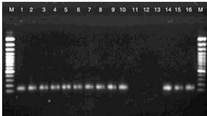
Fig. 1. A 131 bp PCR product resulting from amplification of FMDV RNA extracted from clinical samples and from cell culture. M: DNA size marker, ladder 100, Lane 1-10: Positive clinical samples Lane 11-12: Negative clinical samples Lane 13: Negative control tissue sample, Lane 14: Serotype Asia1 (positive control cell culture), Lane 15: Serotype O (positive control cell culture), Lane 16: Serotype A (positive control cell culture).

Of 12 clinical samples, 10 were found to be positive for FMDV in PCR. Positive and control samples produced a 131 bp fragment in the first round of PCR, while the negative sample failed to produce any DNA band (Fig. 1).