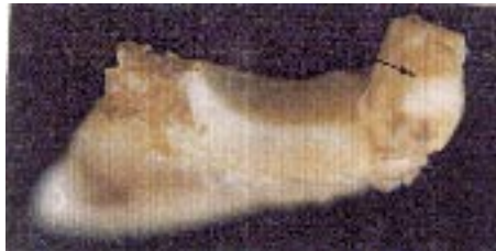
Fig. 9. Distal phalanx in the impala (lateral aspect) is triangular in shape; the articular surface appeared semicircular, (thick), arrow (navicular bone)