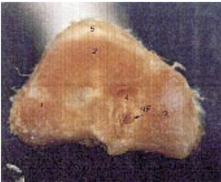
Fig. 3. Proximal extremity of the fused Mc3/4 had three parts of articular surface: 1-medial; 2-central; 3-lateral; 4-a rectangular groove containing a nutrient foramen; 5-metacarpal tuberosity