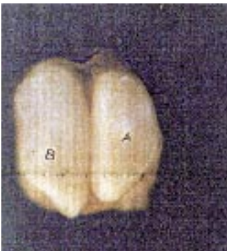
Fig. 5. Distal end of the fused MC3/4 adapted completely to the proximal end of ph I