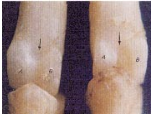
Fig. 7. Distal end of ph I (dorsal aspect) comprises two condyles. The lateral condyle (A) is larger than the medial (B)