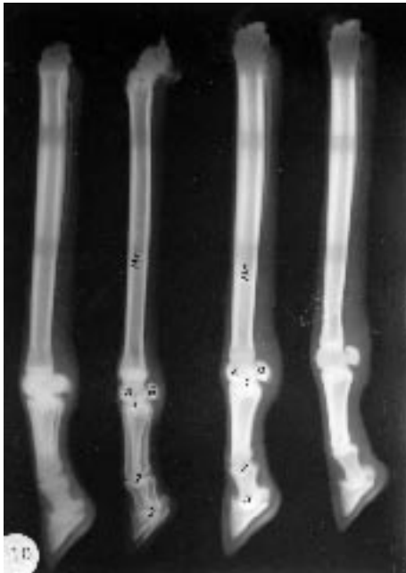
Fig. 10. Latero-medial radiograph of the right metacarpus and phalanges in the impala: Mc: fused Mc3/4 A: distal epiphysis of Mc3/4 B: proximal sesamoid bones, metacarpophalangeal joint (1) proximal interphalangeal joint (2), distal interphalangeal joint (3)