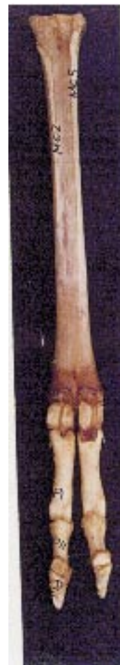
Fig. 2. Skeleton of the metacarpus and phalanges in the impala (palmar aspect); Mc2: second small metacarpal bone; Mc5: fifth small metacarpal bone; the lateral (Mc5) starts a few mm from the proximal extremity, and the medial (Mc5) is attached about 2 cm from the proximal extremity

Impala have two digits, each digit comprising three phalanges (ph I, ph II, ph III) and three sesamoid bones. The proximal sesamoids are four in number, two for each digit. They were situated palmar to the distal end of the fused Mc3/4. The articular surfaces for