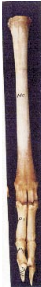
Fig. 1. Skeleton of the metacarpus and phalanges in the impala (dorsal aspect): Mc: fused Mc3/4; ph I first phalanx; ph II second phalanx; ph III third phalanx