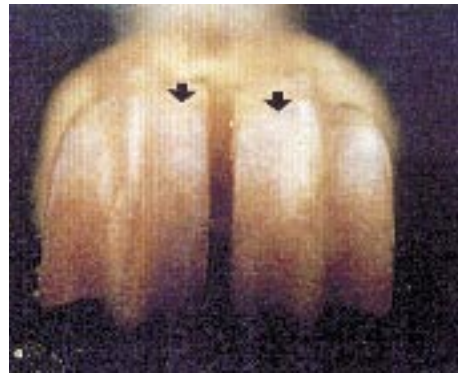
Fig. 4. Distal extremity of the fused Mc3/4 comprises two symmetrical condyles separated by a deep intercondylar groove; the medial condyle is smoothly elevated (arrow) while the lateral one is lower