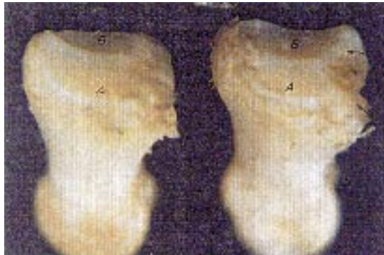
Fig. 8. Proximal extremity of ph II in the impala comprises two parts of smooth articular surface separated by a prominent and sharp sagittal ridge. The lateral part (A) is larger than the medial (B); palmar extremities have two distinct bony prominences (arrow)