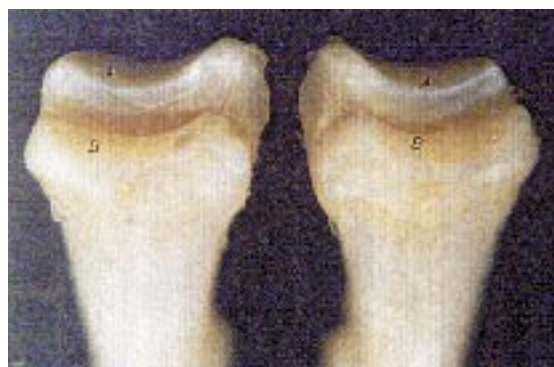
Fig. 6. Proximal articular surface of ph I comprises two parts separated by a sharp, deep sagittal groove. The lateral part is more elevated than the medial, A-lateral articular surface B-medial part of articular surface