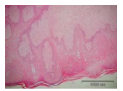
Fig. 1. Histopathological section of a wart tissue stained with HE