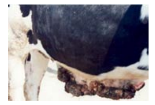
Fig. 3. Multiple papillomas in Holstein heifer disseminated on the abdomen, measuring from 0.5 to 50 mm.