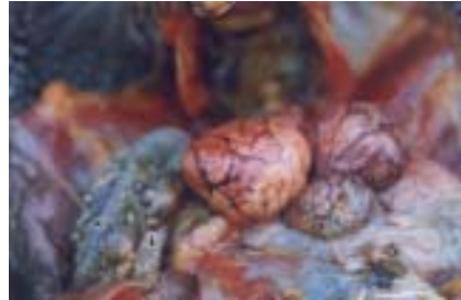
Fig. 2. Close-up of the vascular ovarian growth with metastatic nodules (arrowhead) on the serosa of the duodenum