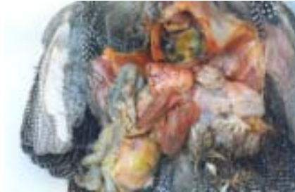
Fig. 1. Fleshy, vascular pedunculated growths on the ovary with nodular lesions on the duodenal serosa, congestion of lungs and hepatosis