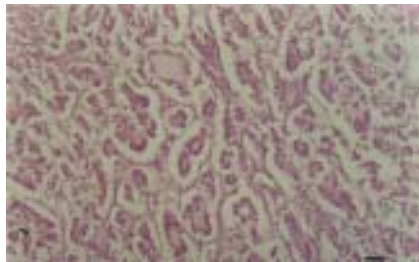
Fig. 3. Ovary - showing tubulo-acinar arrangement of the neoplastic cells with scanty stroma. H&E; \times 400 ; scale bar = 17.5 \mu\text{m} .